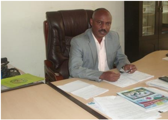
Ato T/Lidet Desta Mayor, Adigrat City

“Currently, in Ethiopia, due to rapid economic growth and high number of population, the issue of obtaining land is not as such an easy task. Some organizations, associations and investors have been requesting our municipality to provide them the plot of land as we gave to OMCUCA for the gardening project. It is weighting all these options that we lastly reached at an agreement to supply about 4000 sq meters to OMCUCA. Now we feel proud of our decision. We are watching certain improvements in the physical farm infrastructure development and a glimmer of hope in the targeted beneficiaries. We are working closely with the project and we are directing our agricultural experts to consult the gardening project in identifying the best possible feasible alternatives that maximize economic benefit for the targeted beneficiaries. Beyond its societal and economic values, the project has also undeniable role in improving the climatic condition of our city. A good beginning is half done!”